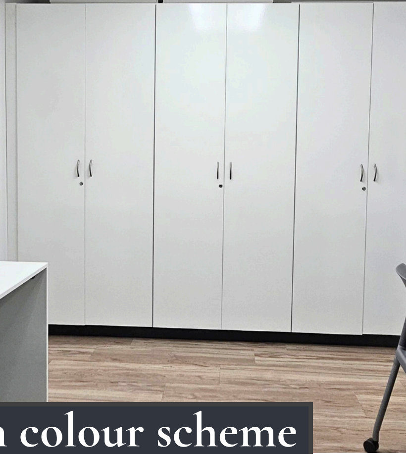
Modern, clean colour scheme with pops of bright colour