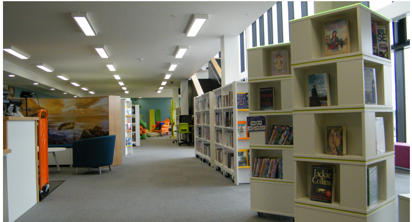
Throughout the library, Cocoon furniture creates a break in shelving and offers visitors alternative seating options. Exciting graphics, that capture the heritage of Wick, can be seen on the walls and as backing for curved soft seating and encourage visitors from all over the world to come in, get comfortable and enjoy their surroundings.