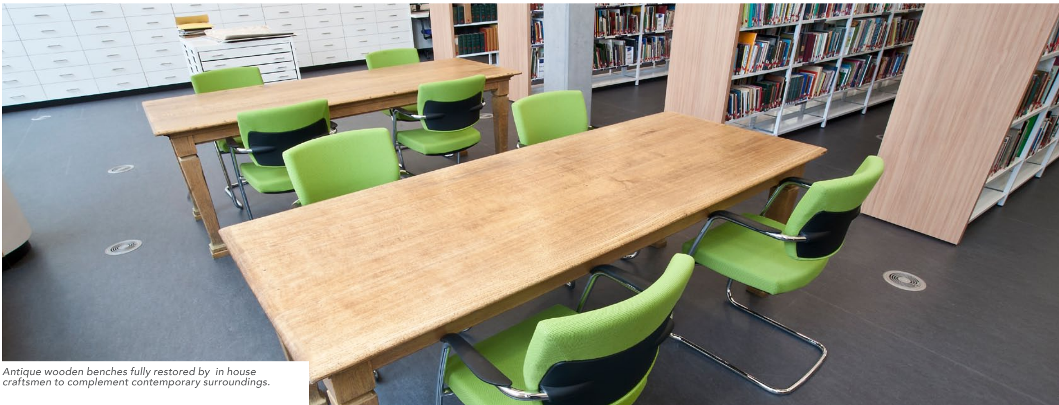
Antique wooden benches fully restored by in house craftsmen to complement contemporary surroundings.