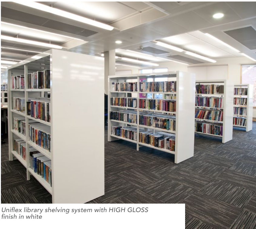
Uniflex library shelving system with HIGH GLOSS finish in white