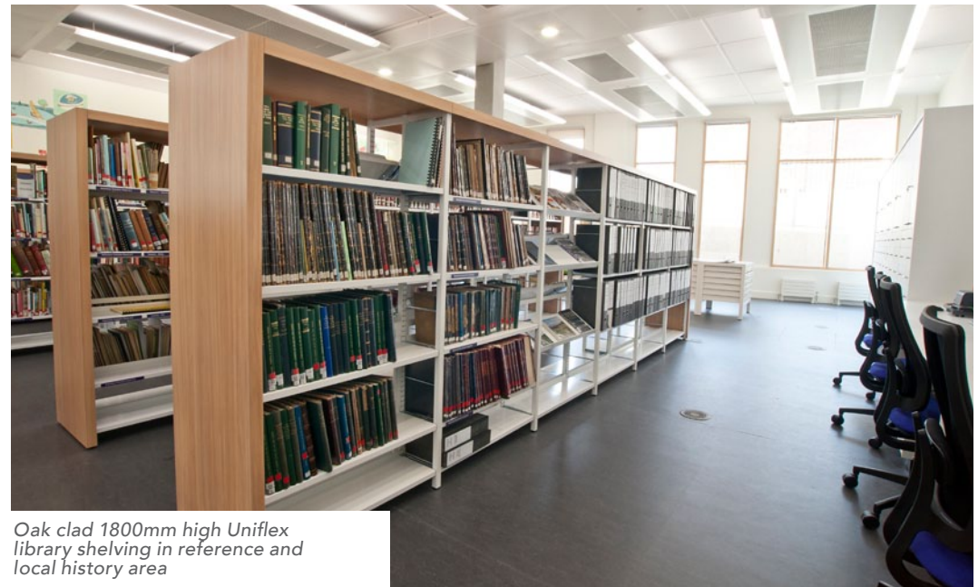
Oak clad 1800mm high Uniflex library shelving in reference and local history area