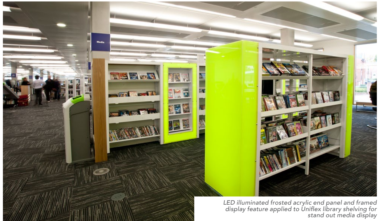
LED illuminated frosted acrylic end panel and framed display feature applied to Uniflex library shelving for stand out media display