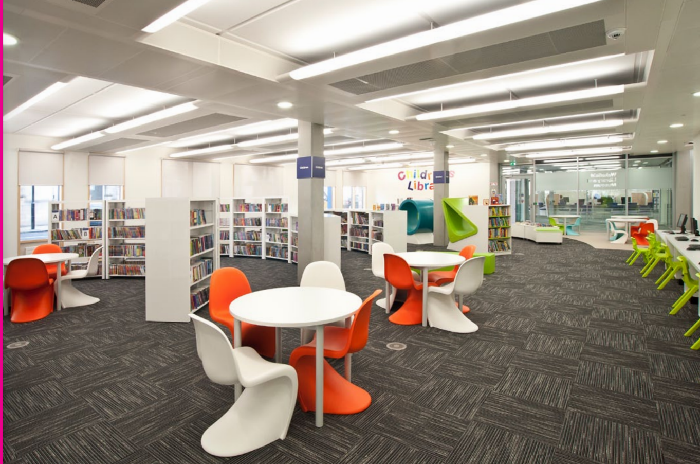
Round study tables and modern junior Pantone chairs, situated in childrens' library alongside high gloss white clad Uniflex library shelving.