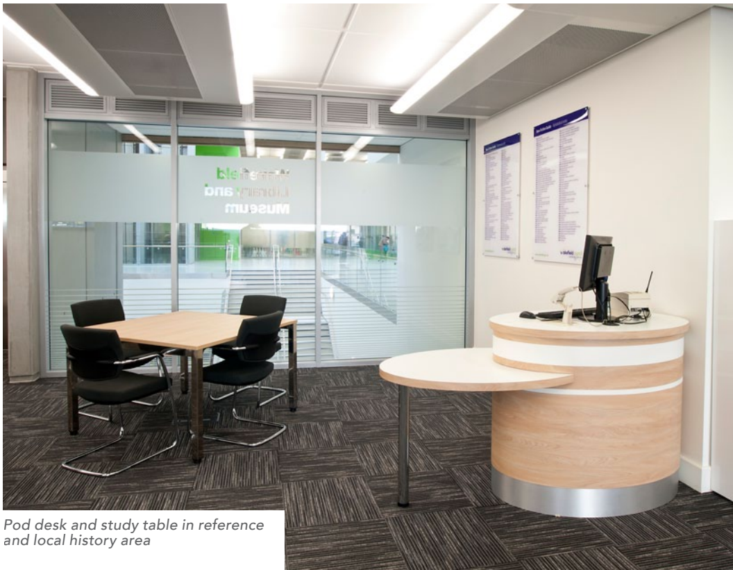
Pod desk and study table in reference and local history area