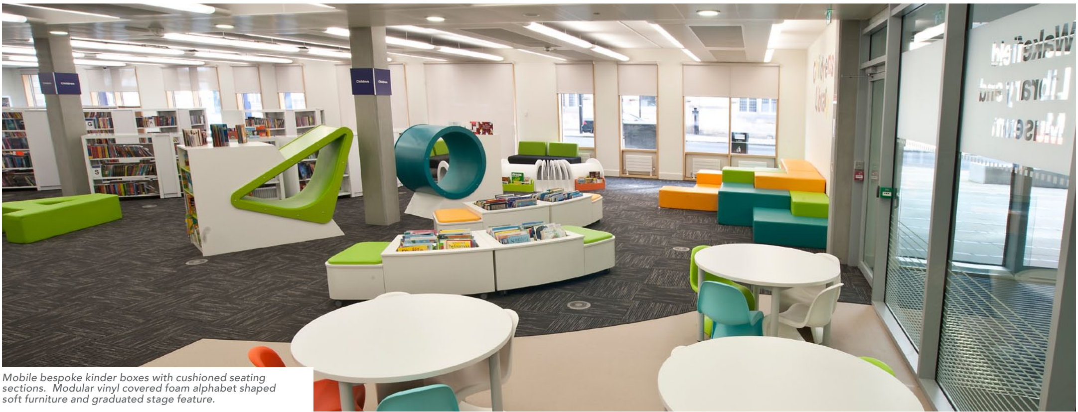
Mobile bespoke kinder boxes with cushioned seating sections. Modular vinyl covered foam alphabet shaped soft furniture and graduated stage feature.