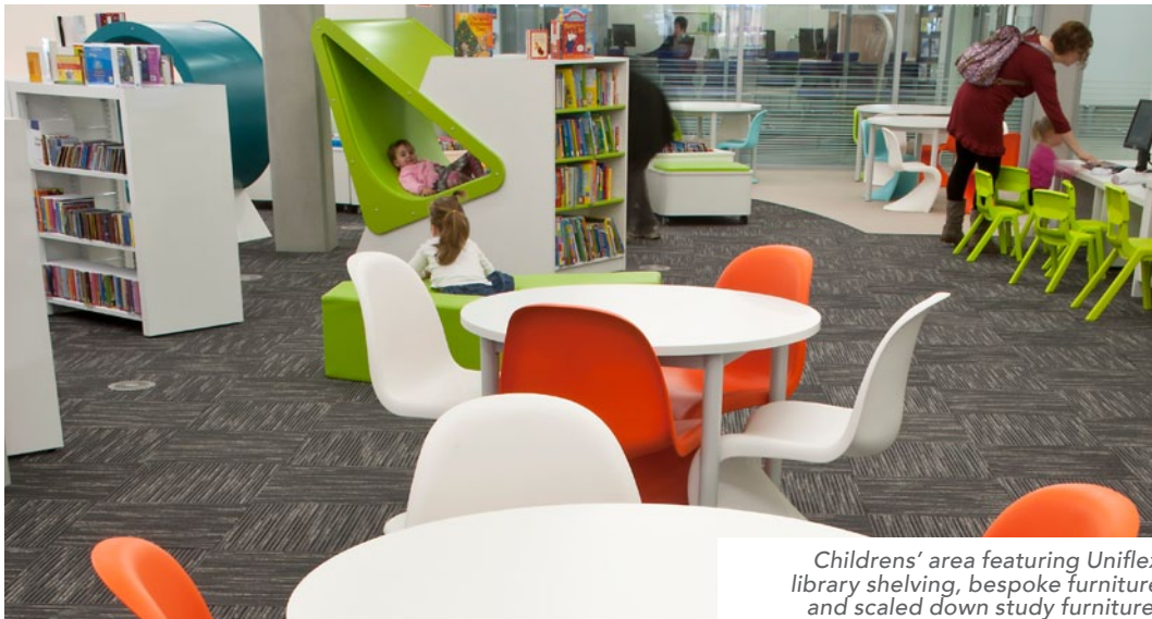
Childrens' area featuring Uniflex library shelving, bespoke furniture and scaled down study furniture.