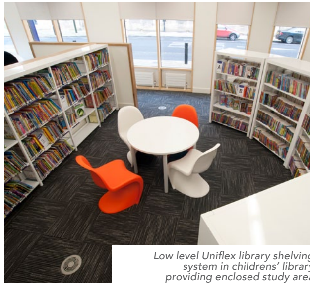
Low level Uniflex library shelving system in childrens' library providing enclosed study area