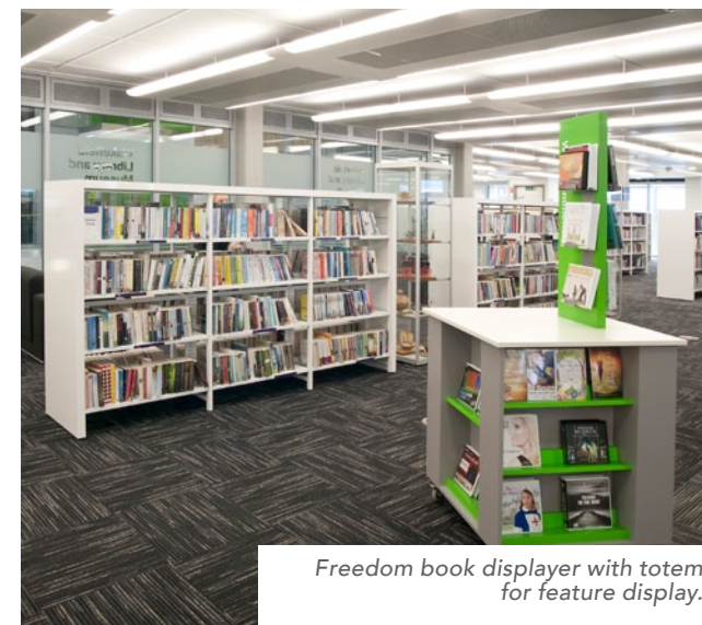
Freedom book displayer with totem for feature display.