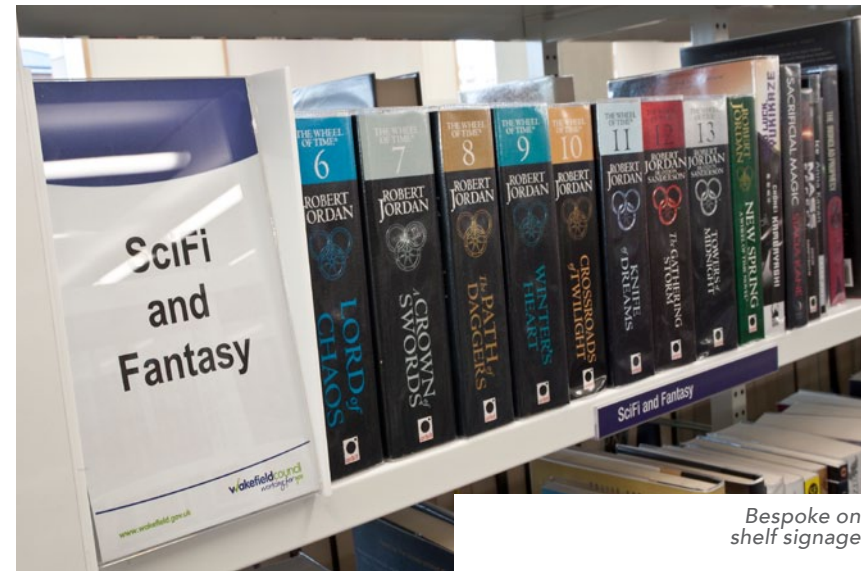
Bespoke on shelf signage