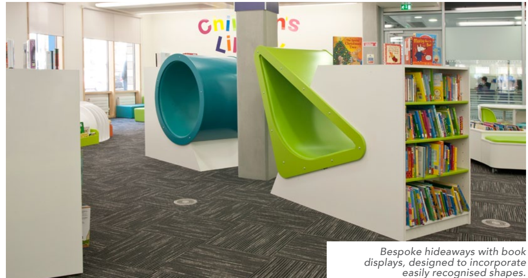
Bespoke hideaways with book displays, designed to incorporate easily recognised shapes.