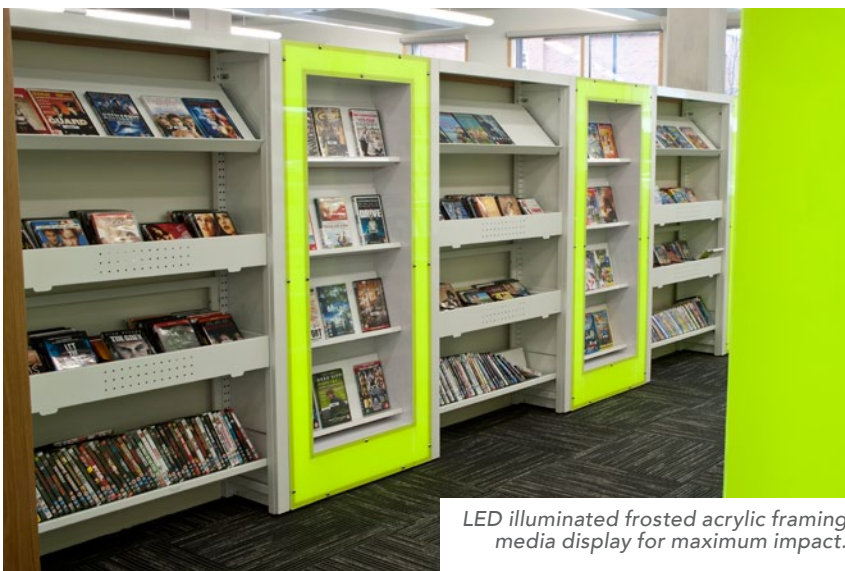
LED illuminated frosted acrylic framing media display for maximum impact.