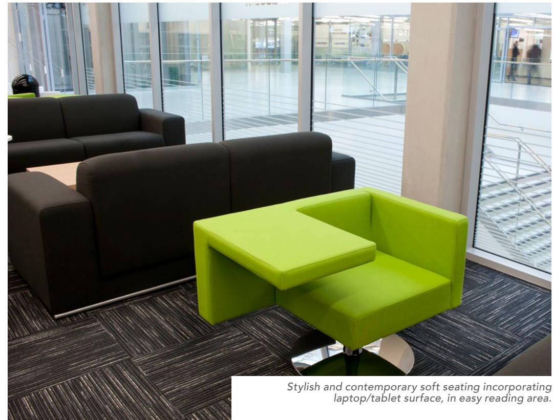
Stylish and contemporary soft seating incorporating laptop/tablet surface, in easy reading area.