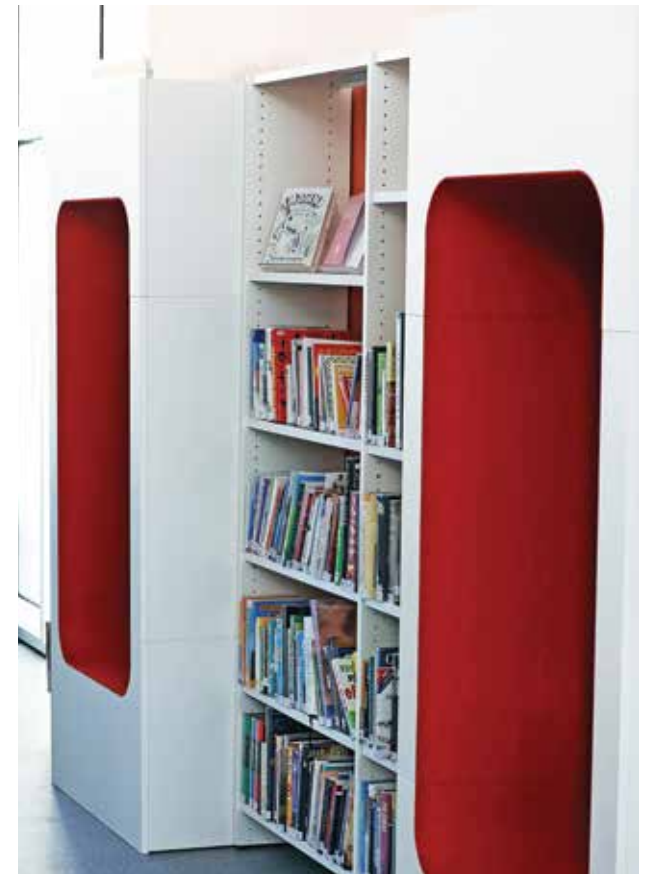
Left: The shelving in the adult area has been carefully planned to work well with the shape of the Architect's feature meeting pod which is clad in striking Zinc! The general seating around the facility has been carefully selected to ensure we meet the individual needs of all users within the facility. Ratio Shelving system has been used with fitted functional display ends and our radiused bookcase inserts allow the design to flow organically. Right: The back wall of the library features our Cocoon Range. The acoustic properties of these cocoons create a haven amongst the shelving to grab a book and read in peace within a large open space.